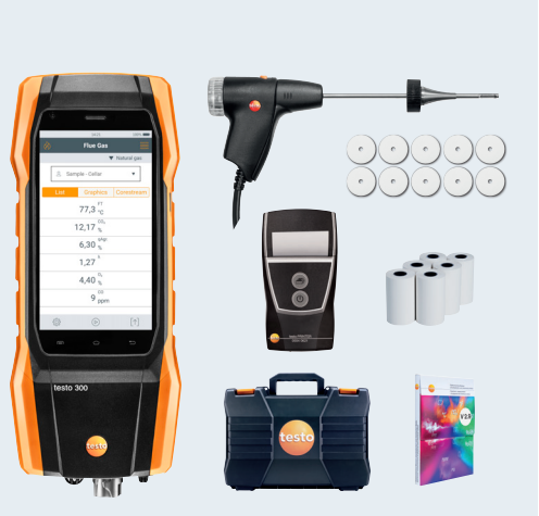
Illustration differs depending on kit type